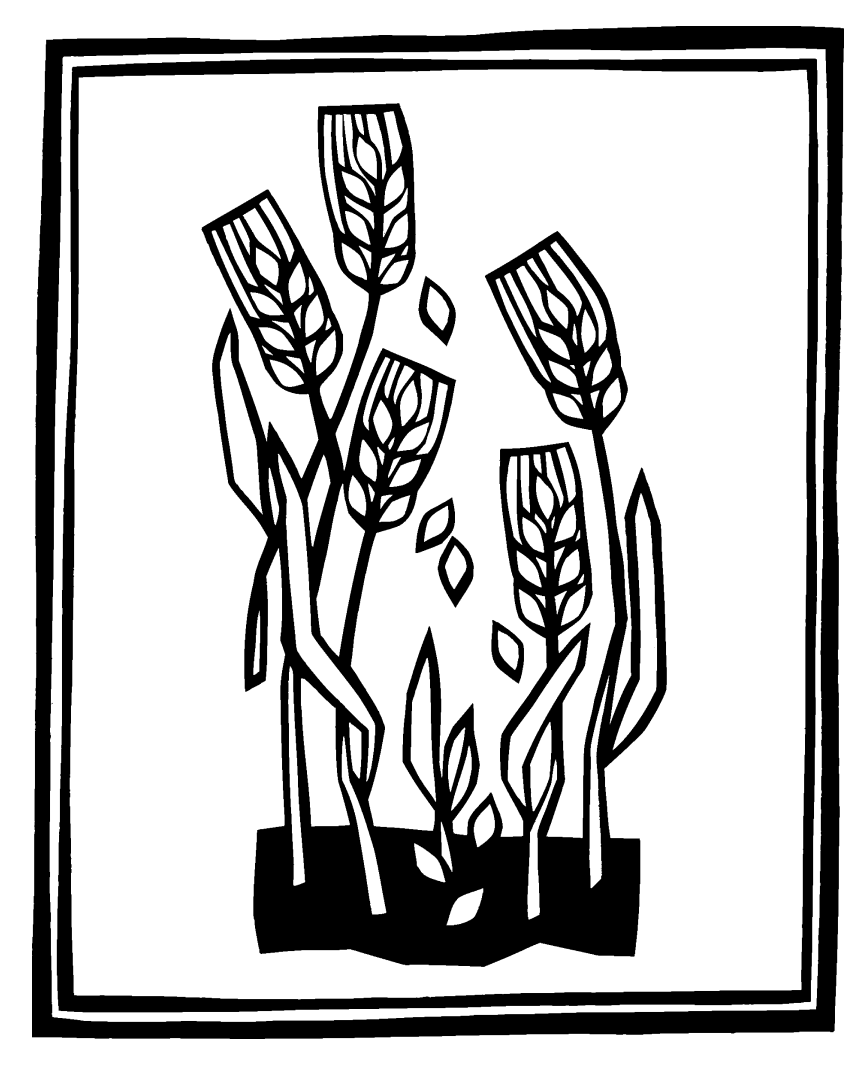
Fifth Sunday in Lent March 17, 2024