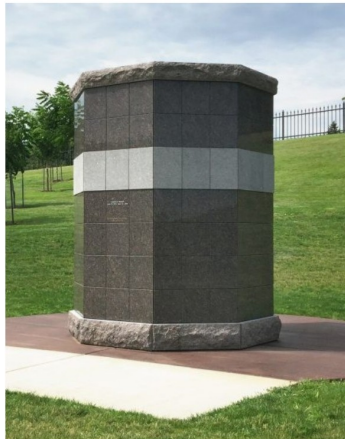
*Example only - color will be different*